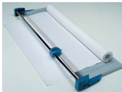
Convenient built-in paper rolls housing for easy cutting operations of large sizes of continuous paper